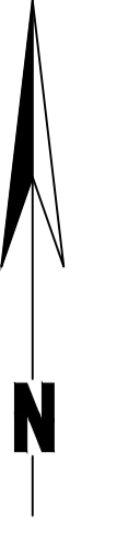
schita dispunere sectoare cadastrale